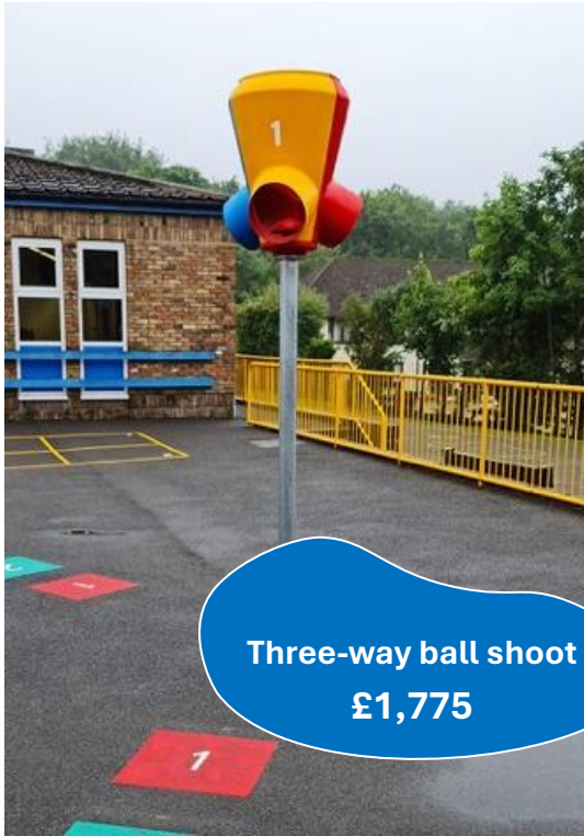
Three-way ball shoot £1,775