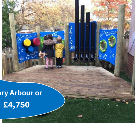
Music & Sensory Arbour or Equivalent £4,750