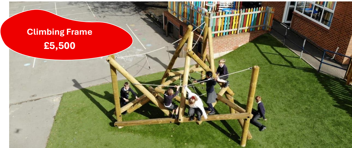
Climbing Frame £5,500