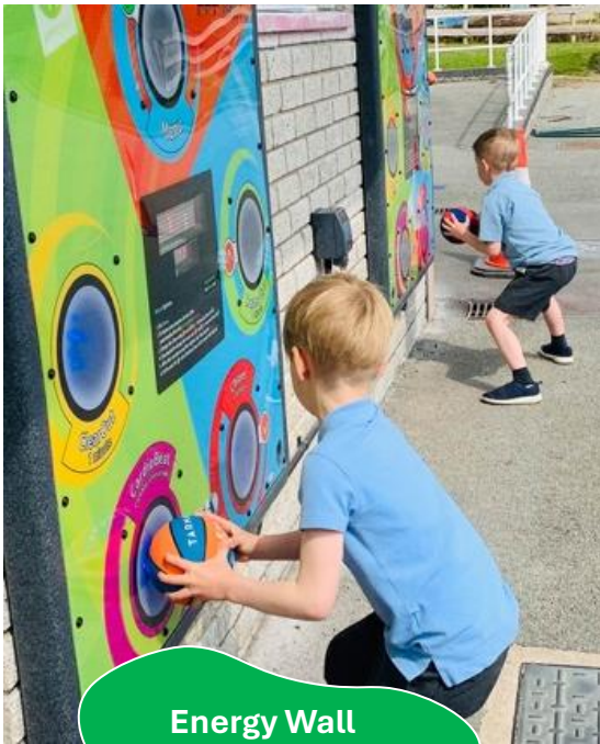
Energy Wall £9,000