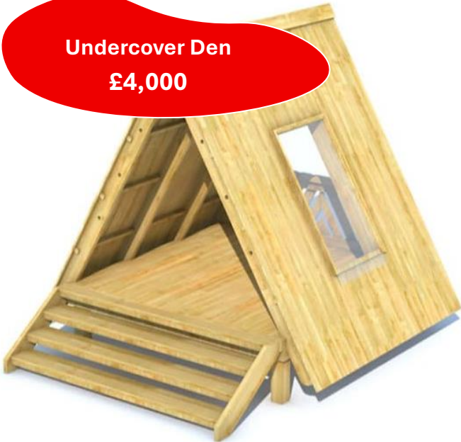
Undercover Den £4,000