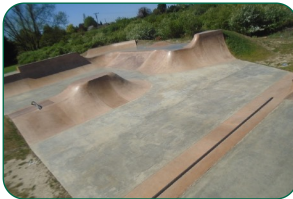
The Doles Skate Area